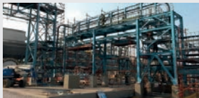
Tsumeb Sulphuric Acid Plant Client: Dundee Precious Metals Location: Namibia Scope: Electrical and Instrumentation