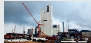
Sasol Secunda Client: Air Liquide Location: South Africa Scope: Electrical and Instrumentation