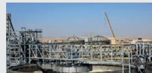
Husab Uranium Process Plant Client: Swakop Uranium Limited Location: Namibia Scope: Electrical and Instrumentation